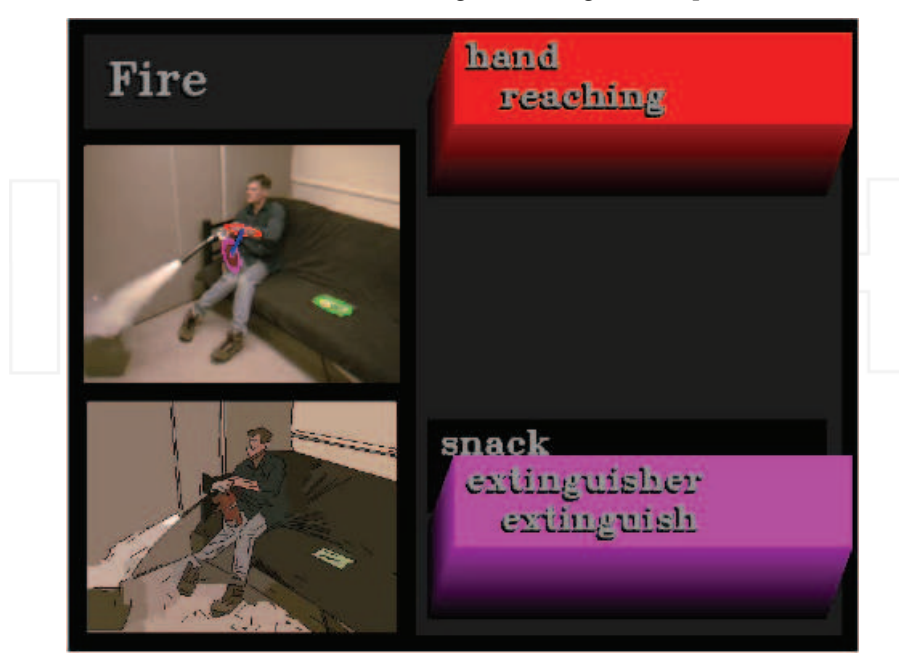
Fig. 4. The robot observer watches as a human uses a fire extinguisher to put out a trashcan fire.

was doing homework, reading a book and taking notes on a computer. In the last scenario, the robot observed a person sitting on a couch, eating candy. A trashcan in the scene then catches on fire, and the robot observes the human using a fire extinguisher to put the fire out.