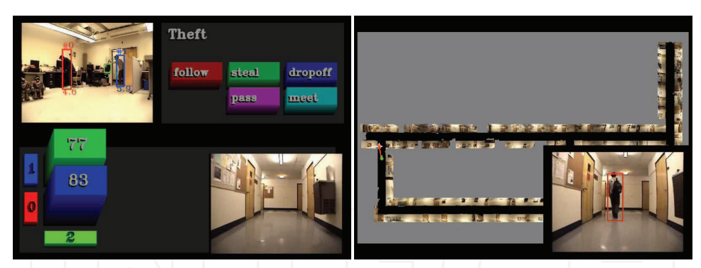
Fig. 2. An observer robot catches a human stealing a bag (left). The top left view shows the robot equipped with our system. The bottom right is the view of a patrol robot. The next frame (right) shows the patrol robot using vision and a map to track the thief.