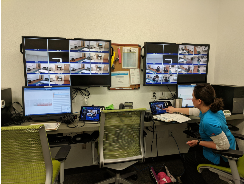
Figure 2: A picture of the standardized patient room control station.