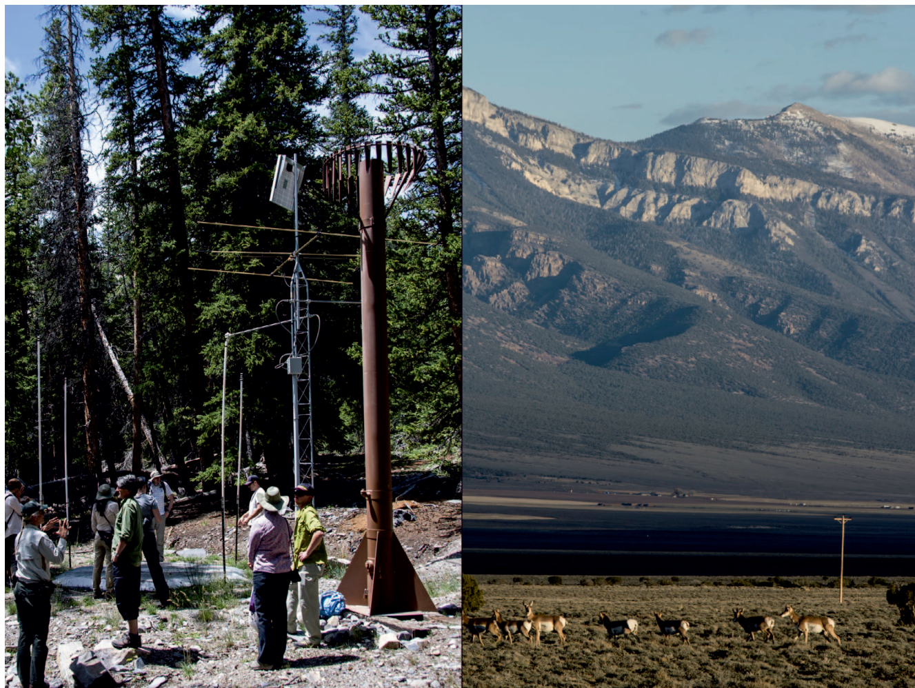
FIGURE 1 Only 1 Snow Telemetry station is present in Nevada's Snake mountain range (39°N 114°W; NRCS 2015), a zone containing the state's second-highest conifer diversity (Charlet 1996). This site (left) is located at 3060 m at the center of a heavily vegetated drainage. Atmospheric observations made here (such as daily maximum and minimum temperature) are unlikely to be representative of the vast majority of locations in the mountain range, which possesses numerous open woodland slopes and exposed topography both below and above the treeline (right).

sciences (Tenopir et al 2011; Michener et al 2012; ESIP Envirosensing Cluster 2016).