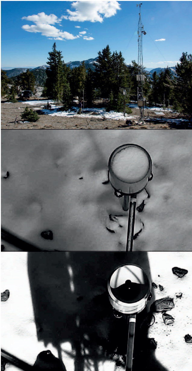
FIGURE 3 Using a webcam as part of an environmental sensor deployment (top) allows the operator to capture images that assist data quality control. In this case, hourly images can show if precipitation is in solid form (middle), which is not usually captured properly by instruments such as a liquid tipping bucket gauge (bottom).